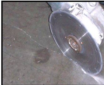
Clean Crack With Diamond Saw Blade