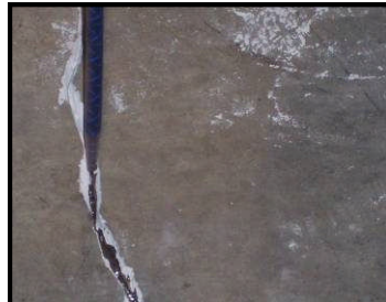
Prime Crack With Quick-Repair 15