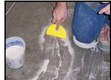
Fill Crack With Silica Sand