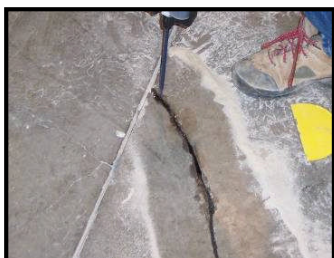
Saturate Crack Until Refusal