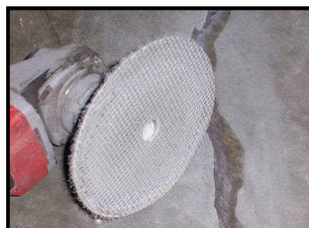
Polish Repair With Diamond Pad